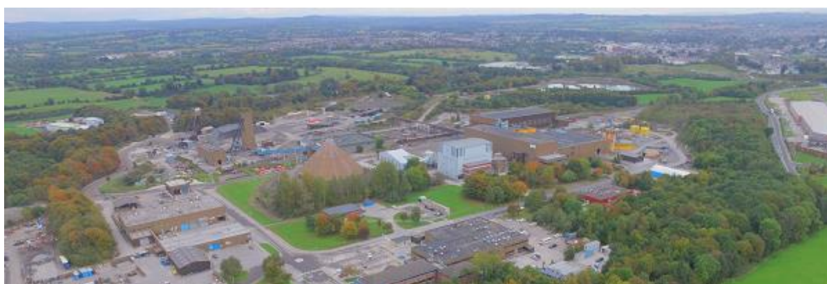
Figure 3 - Boliden Tara Mine at Navan